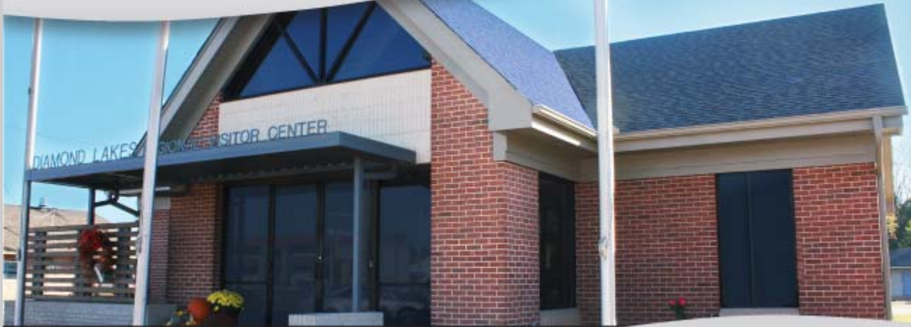
Diamond Lakes Regional Visitor Center